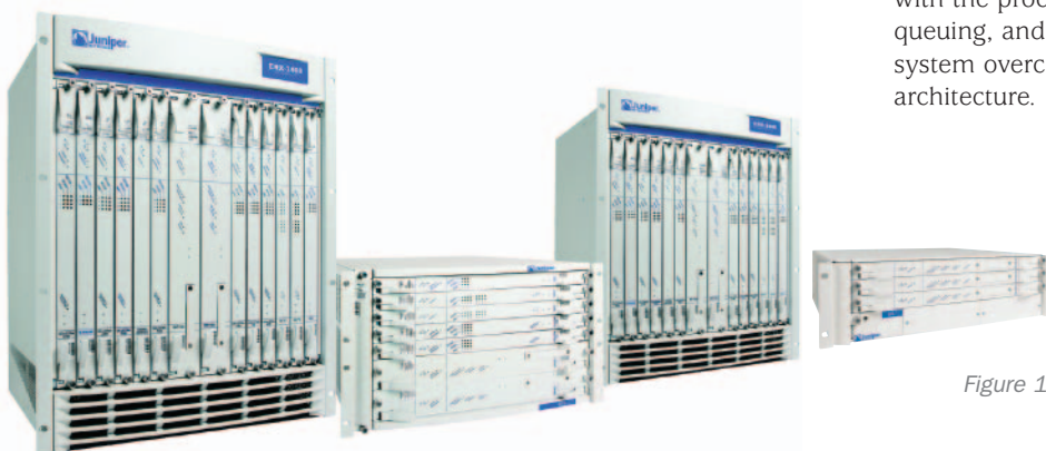
Figure 1: E-Series Routers

The ERX system makes use of application-specific integrated circuits (ASICs) in order to speed IP packet processing. The Juniper Networks custom ASICs, Edge Services Processors, help meet the forwarding demands of the Internet edge. Older-generation routers cannot cope with the processor demands of QoS functions, such as classification, queuing, and scheduling while routing packets at wire speed. The ERX system overcomes these limitations with its hardware-assisted architecture.